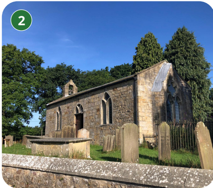
The Church of St Lawrence, Aldfield