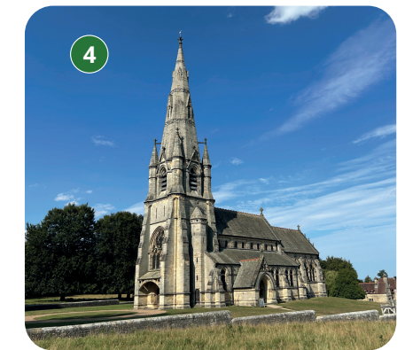
The Church of St Mary, Studley Royal