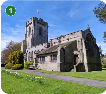
The Church of St Cuthbert and St Oswald, Winksley