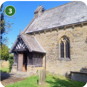
The Church of St Michael and All Angels, Sawley