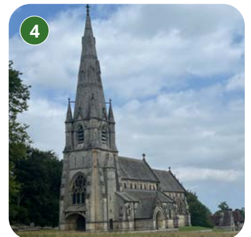
The Church of St Mary, Studley Royal