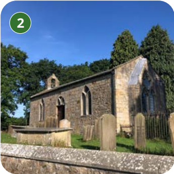
The Church of St Lawrence, Aldfield