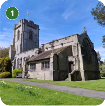
The Church of St Cuthbert and St Oswald, Winksley